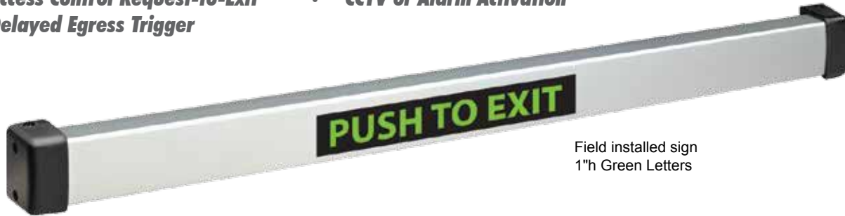
Field installed sign 1" h Green Letters